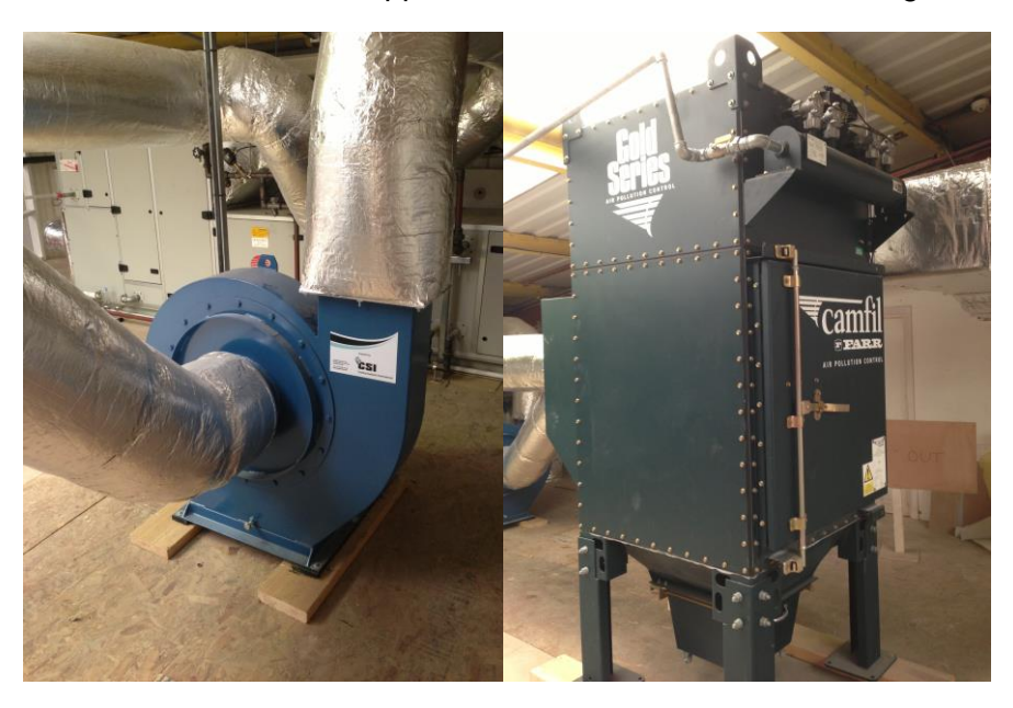
Example of units

An exhaust fan and filter unit will be supplied. The fan will be a free-standing unit sized for the job.