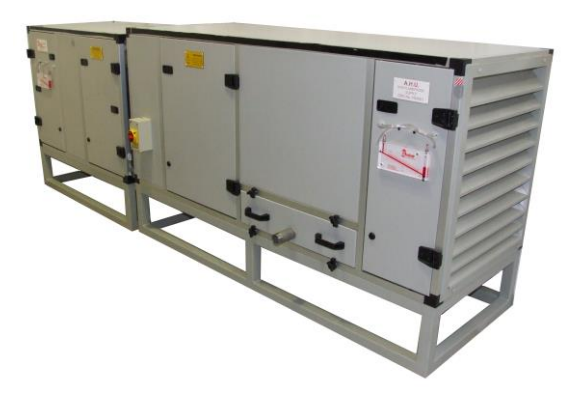
Excluded: Additional steam kit (traps and isolation)

A new inlet unit will be supplied, it will be steam heated with the main control valve supplied.