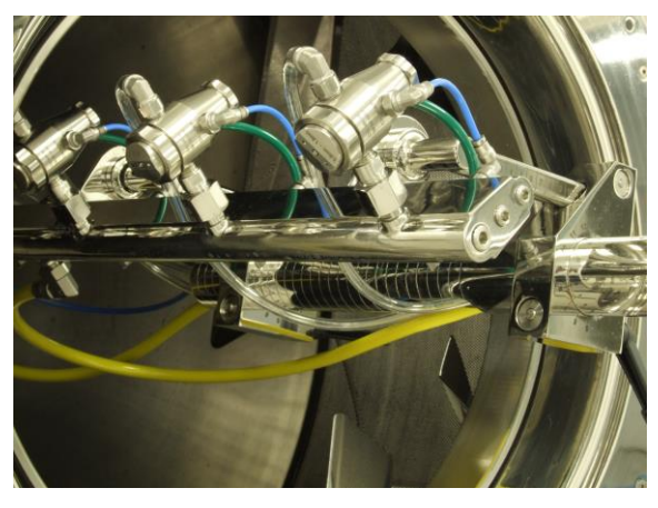
Example of manifold

As a 3-nozzle system a Watson Marlow 500 pump with 3 x 313 pump heads will meet the requirements and be supplied on its own trolley.