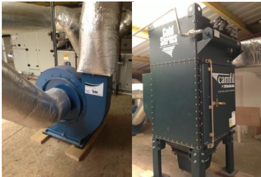
Example of units

An exhaust fan and filter unit will be supplied. The fan will be a free-standing unit sized for the job.