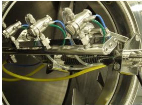
Example of manifold

As a 2-nozzle system, a Watson Marlow 500 pump with 2 x 313 pump heads will meet the requirements and be supplied on its own trolley.